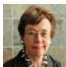
Mary Lassen Center for Community Change